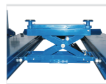
Optional rolling jack.