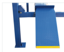
Up ramp with yellow slider can warn people and protect friction.