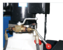
The valve control platform and rolling jack.