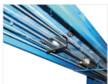
Oil cylinder with explosion-proof valve.