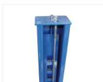
Insurance piece in side the column.