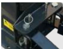
High-precision 5 degrees arm lock