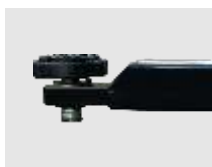
2-stage Screw-up pads