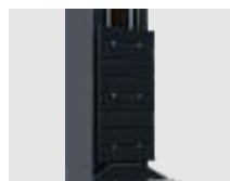
Door Opening Protection Rubber