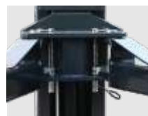
Strengthen carriage Inner arm lock