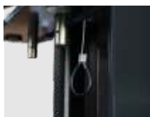
Manual two sides lock release Underlying release cable