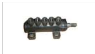
Five way valve