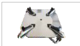
Wear-resistant plate for turntable