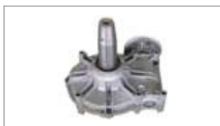
Complete gear box