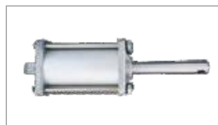
Aluminium small cylinder/circuit