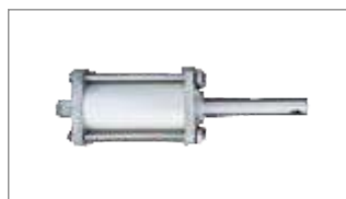
Column small cylinder