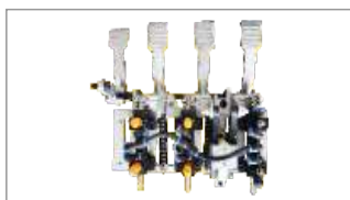
Aluminium Pedal assembly