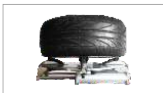
Alloy claw and Φ75 cylinder