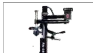
Reinforced right side helparm