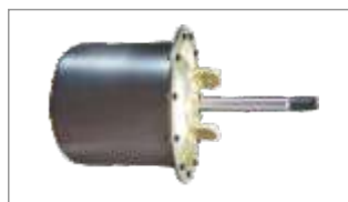
大直径铝活塞气缸 Large Diameter big piston cylinder