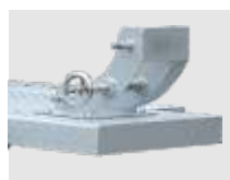
Front wheel holder