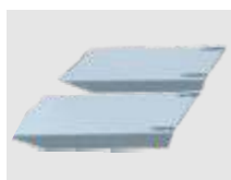
Removable Uphill slab