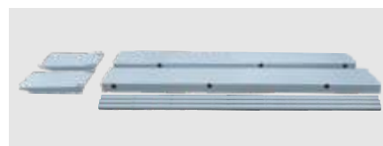
Removable widening plate