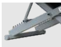
Manual release bar