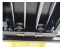
The structure of cable and pulley under main runway.