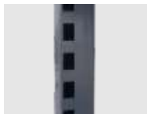
Column safety mechanism