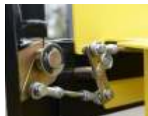
Mechanical unlocking device