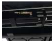
Hydraulic cylinder under runway with explosion-proof valve.