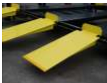
Up ramp with yellow slider can warn people and protect friction.